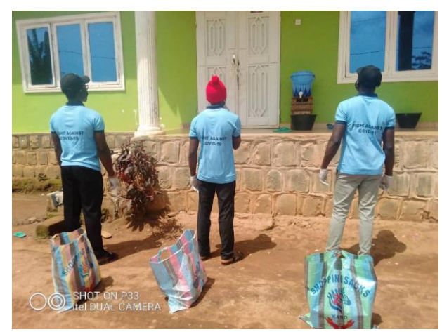
Figure 2. Volunteers delivering soap during a soap distribution.

The soaps were distributed to the community members at no cost