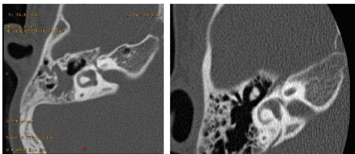
Figure 3: Axial reformatted images of petrous bone issued from AMB and RFN protocol.

As shown in Figure 3, images obtained with AMB CT-scan appeared to be comparable to those obtained with the RFN baseline protocol, with regards to diagnostic quality and interpretability. AMB images were rated as diagnostically adequate, clearly demonstrating the anatomy and lesions in the explored temporal bones.