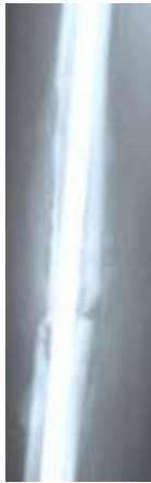
Figure 1: Follow up X ray of the left femur at 10 weeks; Lateral view

She was suspected of postoperative infection and readmitted. All blood tests (FBC, CRP, SR) were normal. Thigh puncture, performed under ultrasound, looking for any possible collection was also negative. Treatment consisted on bed rest and anti-inflammatory drugs. Two weeks later she started complaining of pain during partial weight bearing which was allowed for physiotherapy. X ray was then worse. Compact bone was fully destroyed posteriorly and no callus on fracture site was detected. Biology was still normal. Bone scan was performed at 4 months and revealed necrosis of the outer side of cortex at fracture level with some periosteal activity far from fracture and good osteoblast function on the inner side (fig. 2).