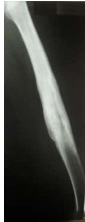
Figure 3a: Follow up X ray of the left femur one month after removal of the medullary nail

We decided the removal of the nail while looking for further bone graft. One month later there was no more complain and X ray revealed fusion on the inner side and new bone apposition on the outer cortex (fig 3a). She was continuously seen 2 during years. There was no limp, no discrepancy and X- ray showed fully consolidated and reorganized callus (fig.3b).