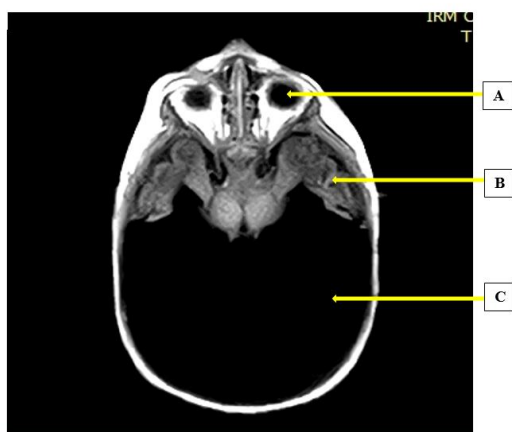
Figure 2: MRI scan of the encephalon in axial section displaying a single dilated supratentorial cavity pushing forward the remaining cerebral parenchyma. A= Left orbital cavity, B= Remaining cerebral parenchyma, C= Single dilated cavity